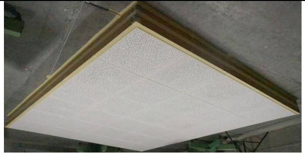
Test specimen installed for testing (image inverted to depict ceiling installation)