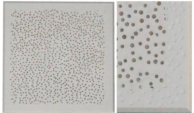
Tile details – Left: whole tile, Right: close-up view