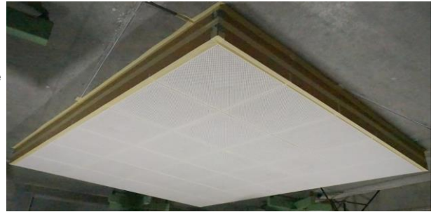
Test specimen installed for testing (image inverted to depict ceiling installation)