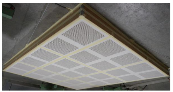
Test specimen installed for testing (image inverted to depict ceiling installation)