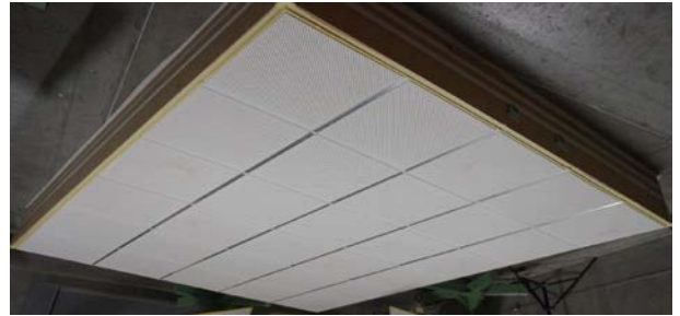
Test specimen installed for testing (image inverted to depict ceiling installation)